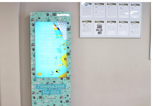
Entrance and School Museum

InfoZone points are always located in public well-frequented spots for maximum exposure. This is usually the main hall or entrance area of the school. An InfoZone can consist of a single LCD display, but sometimes includes a video wall, a kiosk display, or an LCD screen. Content may differ from location to location, depending on whether the school disposes with one or multiple InfoZone points – for example, different class schedules on different floors.