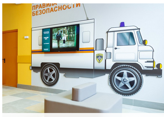
Halls and other Floor Areas

These types of InfoZone points include a professional panel along with a decorative stand with LED backlighting. The stand itself shows a map and encourages students' curiosity about geography.