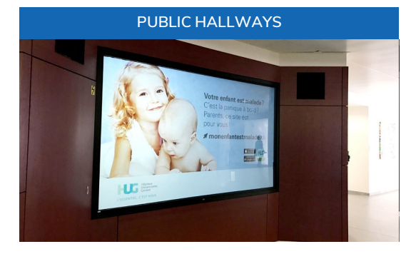
List of doctors on call, last-minute room changes, real-time wayfinding, interactive facility maps, emergency dashboards.

Room appointment info, employee announcements, staff planning, workshop dates and topics, info about ongoing experiments and results.