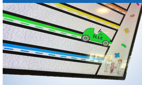
Real-time waiting times, RSS news, TV streaming (CNN, ESPN), doctors' schedules, health and wellbeing tips.